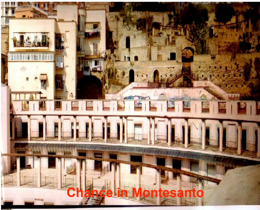
Chance in Montesanto